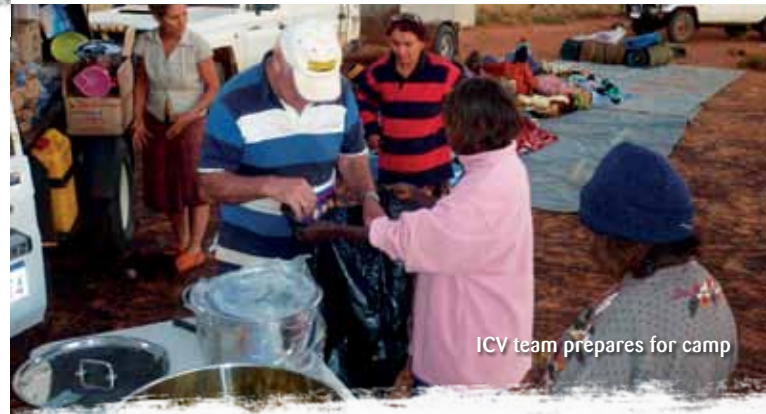
ICV team prepares for camp