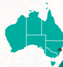
WESTERN SYDNEY, NSW

Our national network of skilled volunteers provide practical support where skills and resources are limited.