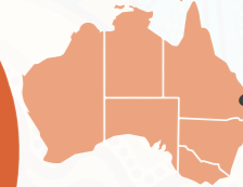
SUNSHINE COAST, QLD

Murri's on the Move Driving School supporting people in QLD to gain independence and improve employment opportunities through driver training.